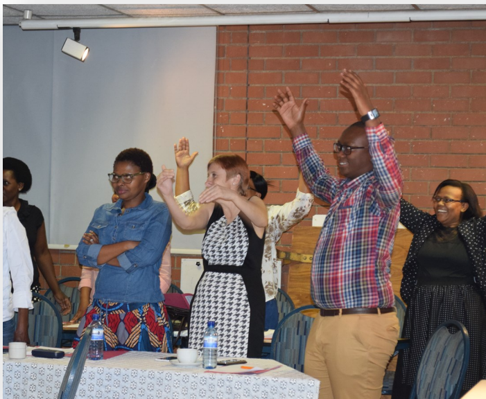
Librarians enjoying their workshop