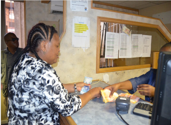
Executive Mayor, Cllr Lindiwe Makhalema leading by example

Executive Mayor, Cllr Lindiwe Makhalema launched operation Patala on the 2 nd December 2016 at Dihlabeng Local Municipality, Head Quarters. The launch was attended by Dihlabeng residents, local businesses, different government departments and municipal employees. The aim was to encourage them to pay for their municipal bills in order to receive quality basic services like clean water supply, sewage collection and disposal, refuse removal, maintained municipal roads, storm water drainage, street lighting and other services.