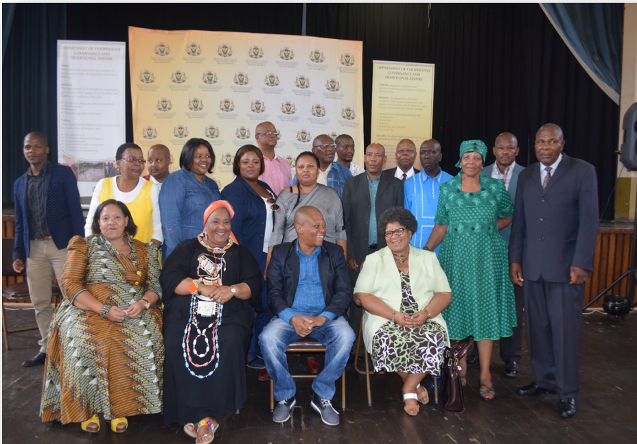
MEC and Traditional Leaders